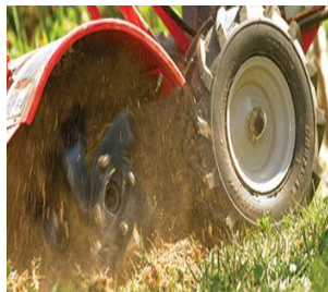
Counter Rotating Tines