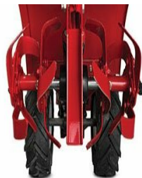
Bolo Tine Design