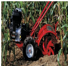
Rear Tine Tillers