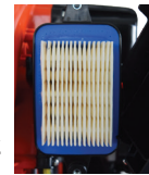
TOOL-LESS AIR FILTER COVER