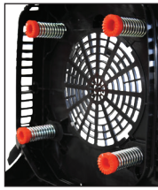
4 ANTI-VIBRATION SPRINGS