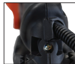
IN-GRIP ADJUSTMENT OF THROTTLE CABLE