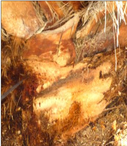
1: Cleaning the place of infection

Note: First clean the place of infection and prepare the pesticide ( Trigard 75 WP ) that rate 2 grams per 1 liter of water.