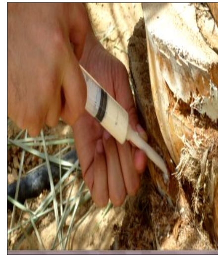
7: Injection the pesticides