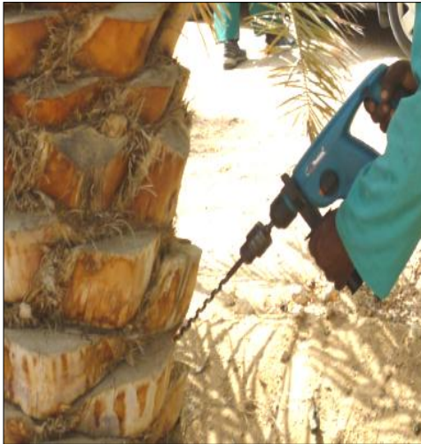
2: Slope drilling