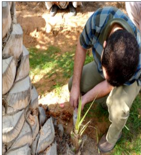
6: Drag the solution by syringe