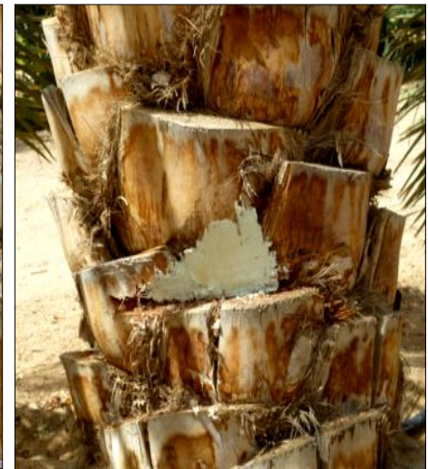
8: Close the holes with cement or sand