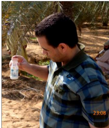
5: Mixing the pesticide with water