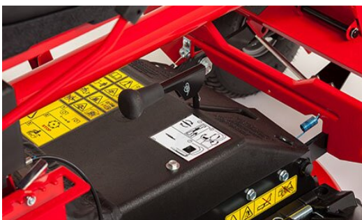
Manual deck engagement Easily engage the deck with the ergonomically placed lever.