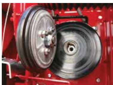
CONTROL YOUR SPEED Variable speed disc drive transmission. Easily change from mulching to side discharge.