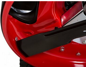
HI VAC® MOWING DECK Hi Vac® mowing deck.

Cast-iron pivoting front axle The rigid front axle ensures maximum control while manoeuvring.